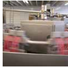
Food & Beverage